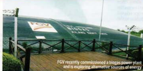
FGV recently commissioned a biogas power plant and is exploring alternative sources of energy

"We acknowledge the potential adverse environmental and social impacts linked to any business activities, including deforestation, carbon emissions and labour issues. Therefore, we are collaborating with stakeholders to promote sustainable forest management and develop sustainable production systems that contribute to poverty reduction and economic development while protecting the environment and conserving biodiversity."