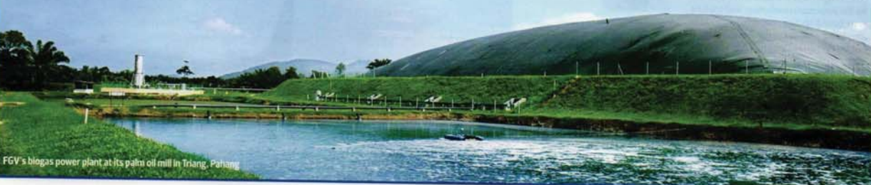
FGV's biogas power plant at its palm oil mill in Triang, Pahang

These actions position FGV as a leader in sustainable business practices, setting an example for the industry and demonstrating that a commitment to sustainability is not only vital for the environment but also for long-term business success.